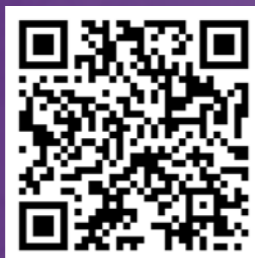
BBC Bitesize History

Use online revision tools like BBC Bitesize at home to improve your history knowledge even more.